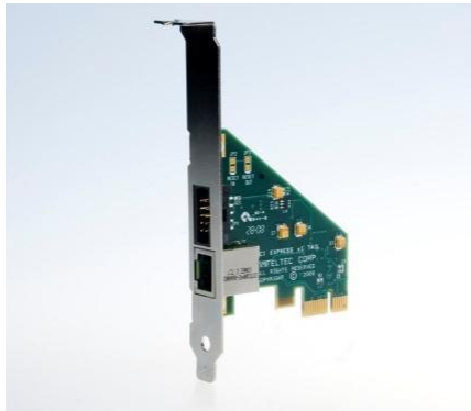
Figure 2: PCI express interface board