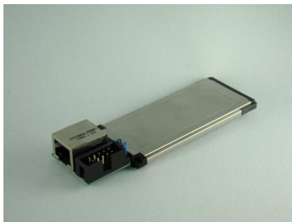
Figure 3: ExpressCard® interface board