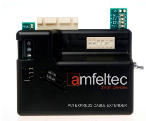
Figure 1: PCI express Cable Extender

The Cable Extender uses a bus switch to connect/disconnect the UUT PCI express board from the host computer without it shutting down. This flexibility minimizes the testing time, protects the host computer from damage and what is new make it possible to move noisy computer out of the way. At the same time, by using connection via ExpressCard® it allows to connect x1 PCI express board via PCI express Cable extender to any laptop.