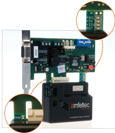
Figure 4: PCI express stabilization tabs