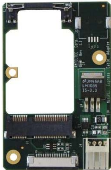
Figure 3: MiniPCI Express Adapter board