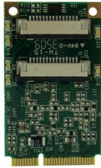
Figure 2: MiniPCI Express Splitter Host Card