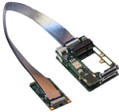
Figure 1: Flexible MiniPCI Express 2-Way Splitter

Flexible MiniPCI Express 2-Way Splitter (Splitter) (Figure 1) is designed to support expansion of modern motherboards with limited number of MiniPCI Express connectors. Splitter splits standard MiniPCI Express motherboard slot into 2 independent MiniPCI Express slots.